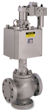
8413 Series Liquid Fuel Oil Stop Valve