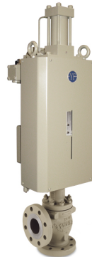
Quaternary 2" Valve