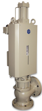
PM-2 3" Valve